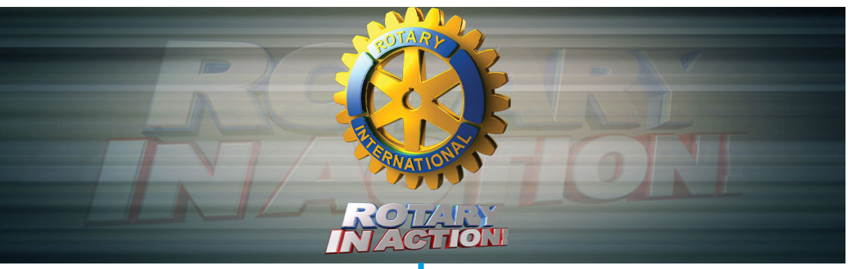
Save the Date October 6, 2018